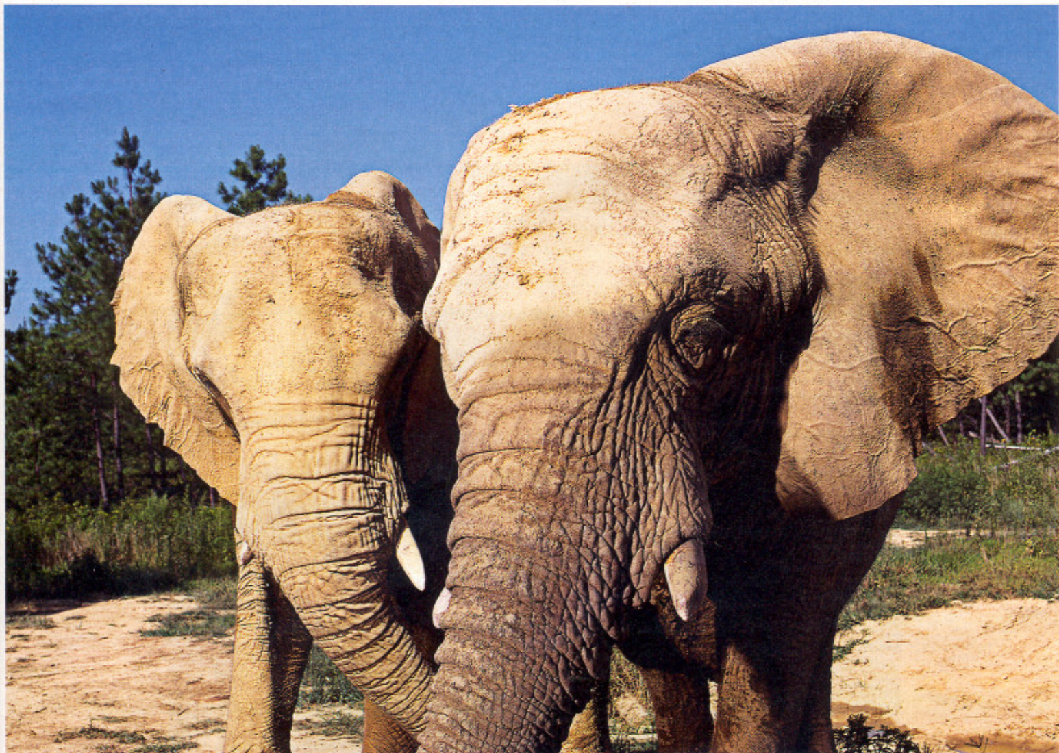
In Recovery Tange and Zula are living out their days in the Elephant Sanctuary in Tennessee, an asylum for abused elephants. (Page 42)