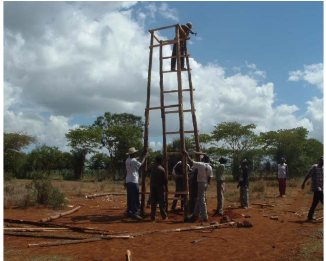
Farmers erect an observation tower near farmlands in Oloitokitok area.

Observation towers are vantage points from where farmers can detect approaching elephants. This strategy seemed to work if the tower was set along paths frequented by elephants as they approached farmlands. The farmers need to have powerful torches, normally powered by 4×D size batteries. A network of watchtowers is useful as farmers can send signals to one another e.g. using torches to alert each other of approaching elephants. Such towers proved to be critical in the AERP HEC project since there was a tendency for some elephant groups to move to neighboring farmlands when they were chased away from another. The cost of constructing a watchtower ranged from as low as Kshs 200 (USD 3) if the farmers were able to acquire poles on their land, to about Kshs 1500 (USD 20) if they had to purchase them.