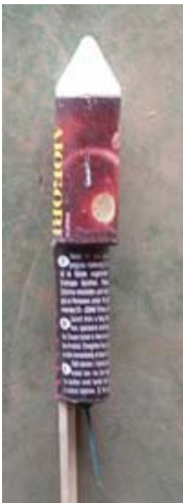
1.1. "Rocket" type firework

The price for an assortment of fireworks ranged from Kshs 30 (USD 0.40) to 100 (USD 1.33), well within financial reach of farmers in the Amboseli region.