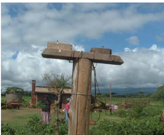
A double trip wire system with the alarms set inside the farmer's house.