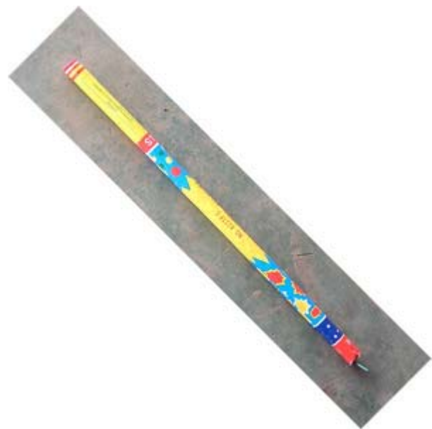
1.2. "Candle light" colored shots, ignited and directed towards elephants