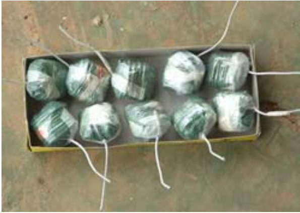
1.3. "Commando bombs" ignited and thrown towards attempted crop raiding elephants.