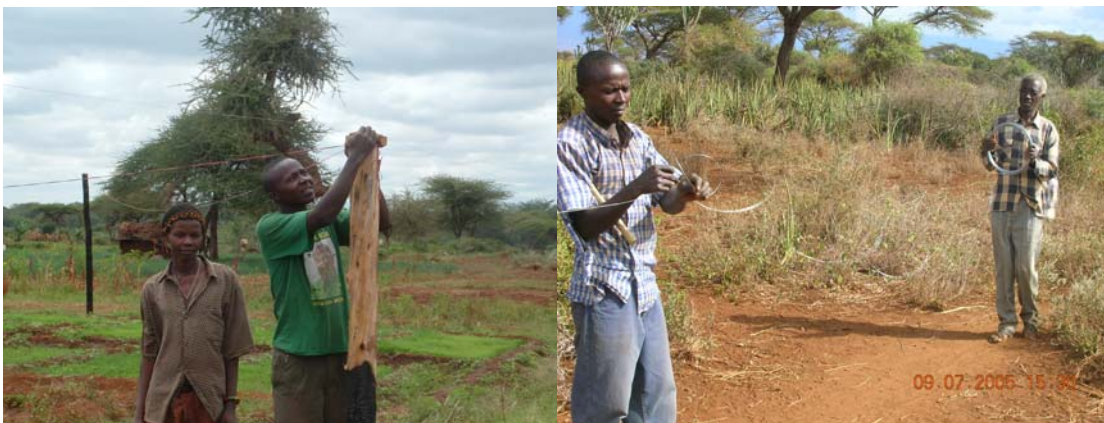
Farmers in Isinet setting up a trip wire system.

We observed that the trip wires at times acted as physiological barriers to elephants, they retreated upon approaching the trip wires and then walked along the wire-line. They may have perceived the trip wire to be electrified.