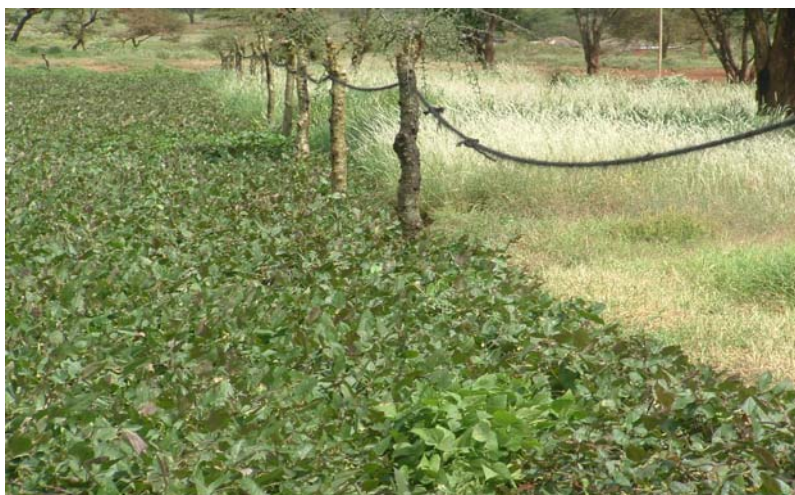
Chili-tobacco rope enclosing a bean farm to keep elephants away.

Nylon ropes (12 mm thick) are recommended since they last relatively long. Sisal ropes are, however, a cheaper substitute. In the Oloitokitok area, we used proportions of 1 kg chili and 1 kg tobacco mixed in 20 litres of used engine oil. The concoction is applied on the ropes on a weekly basis. For the supporting posts, we recommend that farmers plant trees (such as Commiphora africana ) that will root, this ensures that they don't periodically have to cut trees to replace the poles.