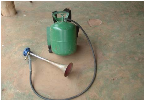
Air pressure horn used to deter elephants from crop fields.

Approx. cost for the first few pilot sound devices were Kshs 4,000 (USD 55), with the air release/handle as the most expensive part.