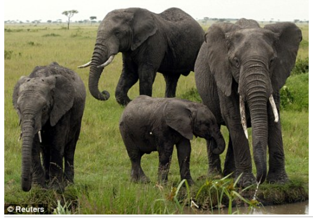
The study found that elephants empathise with each other a lot more than previously realised - they had long been known to grieve over their dead

Negotiations over directions often begin with a common signal known as the 'let's go' rumble.