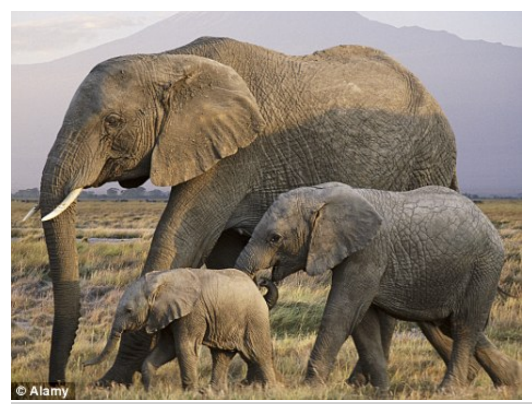
We are family: The study, which lasted almost 40 years, found that elephant behaviour is similar to humans